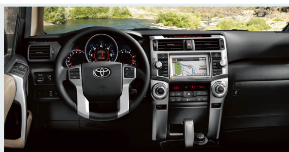
Limited 4x4 shown in Sand Beige leather with available voice-activated touch-screen DVD navigation system. [9]