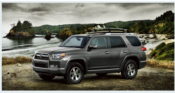
Limited 4x4 shown in Shoreline Blue Pearl [27] with available accessory roof rail cross bars.