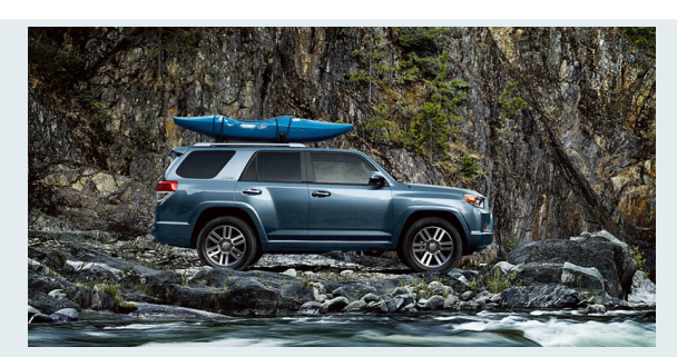
V6 SR5 4x4 shown in Magnetic Gray Metallic with available backup camera [10], Convenience Package and accessory roof rail cross bars.