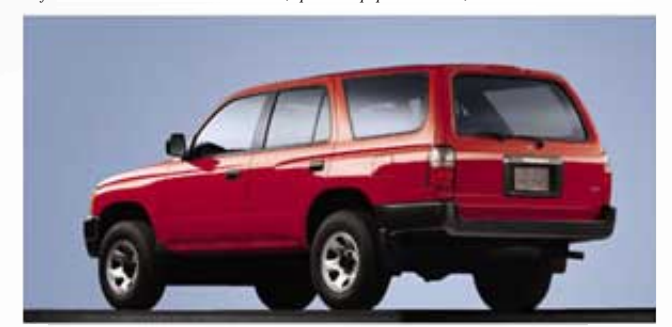
Toyota 4Runner SR5 Shown in Radiant Red