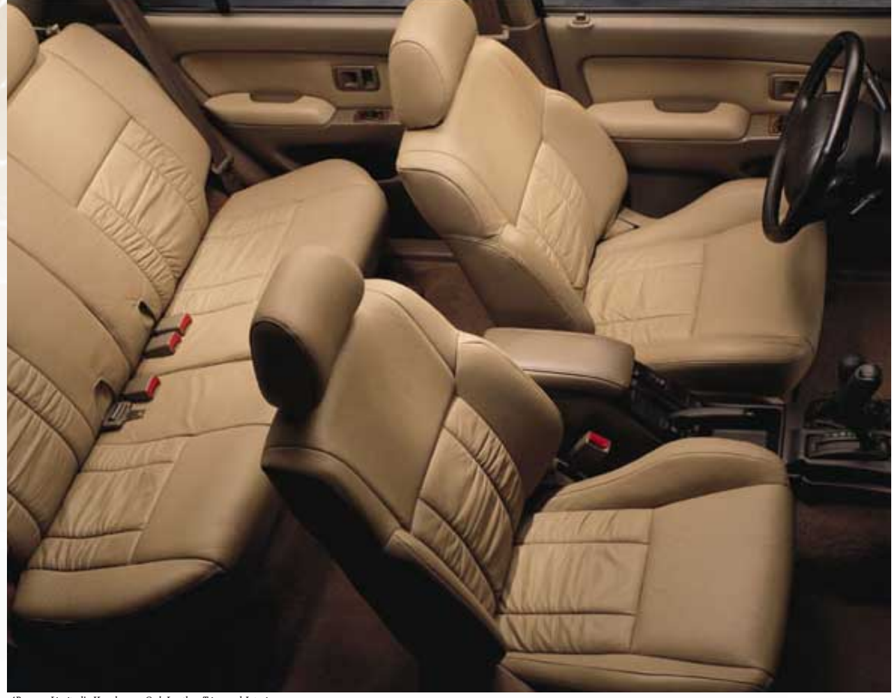
4Runner Limited's Handsome Oak Leather Trimmed Interior