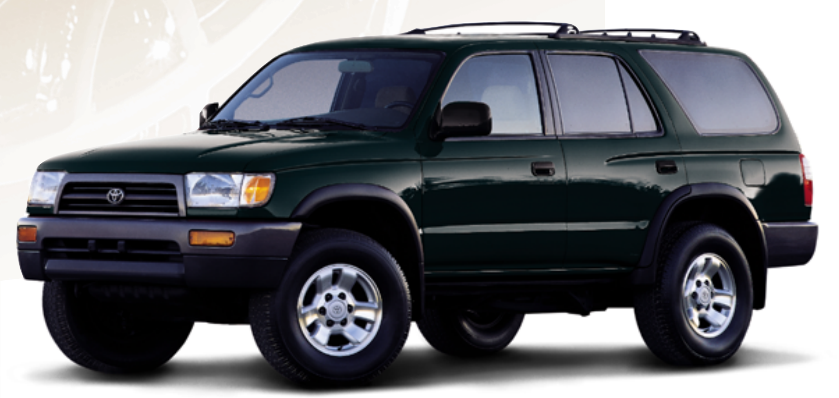
4Runner SR5 Shown in Dark Teal Green Mica with Optional Equipment

4Runner SR5's 2.7 Litre DOHC 16-valve 4-cylinder with sequential multi-point EFI delivers 150 hp. @ 4800 rpm. Two counter-rotating balance shafts help minimize internal vibrations so it runs incredibly smooth. A 5-speed overdrive manual transmission or optional 4-speed overdrive (ECT) automatic combine for maximum performance and fuel economy. Steering feel and response