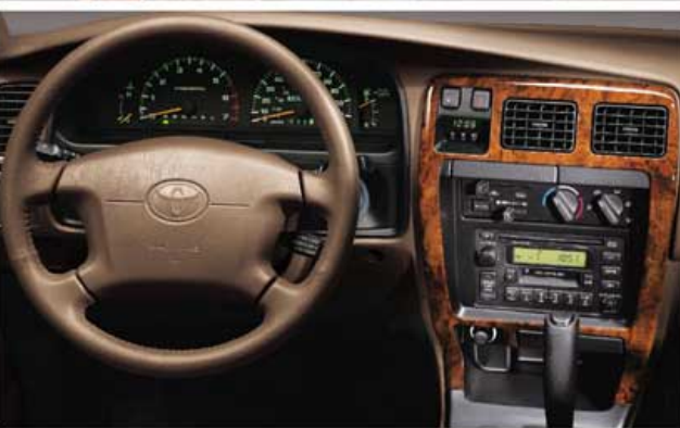
Two Views: 4Runner's Simulated Wood Accents and the Ergonomically Designed Instrument Panel