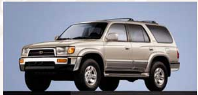
Toyota 4Runner Limited Shown in Desert Dune Metallic

With its muscular physique and chiseled features, the 1998 4Runner is an imposing figure. It looks unstoppable, yet there exists an unmistakable air of dignity and sophistication. Soft curves outside continue inside with the gentle slope of the centre console, the shape of the seats and the way the instrument panel flows smoothly into the door panels to create a relaxed, soothing environment. Mechanical elegance is everywhere: in the low effort steering; in the powertrain's amazing blend of performance and fuel economy; and in the generous cargo capacity enclosed within compact exterior dimensions. 4Runner available in three different models: Limited, SR5 V6 and SR5. Toyota Quality... discover it for yourself.