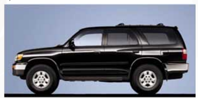
Toyota 4Runner SR5 V6 Shown in Black (Optional Equipment Shown)