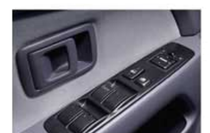
4Runner Limited's Central Power Control Armrest (Optional on SR5 & SR5 V6)

4Runner's gauges have been arranged for optimum visibility, a door ajar warning lamp is included for safety and the cruise control* is activated by a column-mounted lever for better accessibility. The cluster above the centre console houses frequently used controls such as air conditioning, audio etc. Limited's premium 3-in-1 audio system delivers rich audiophile quality sound in AM/FM, cassette or CD format. Six strategically placed speakers let you appreciate the symphony or the subtleties of an acoustic guitar.