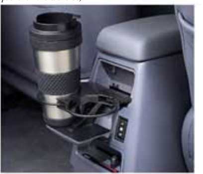
4Runner's Rear Cup Holder