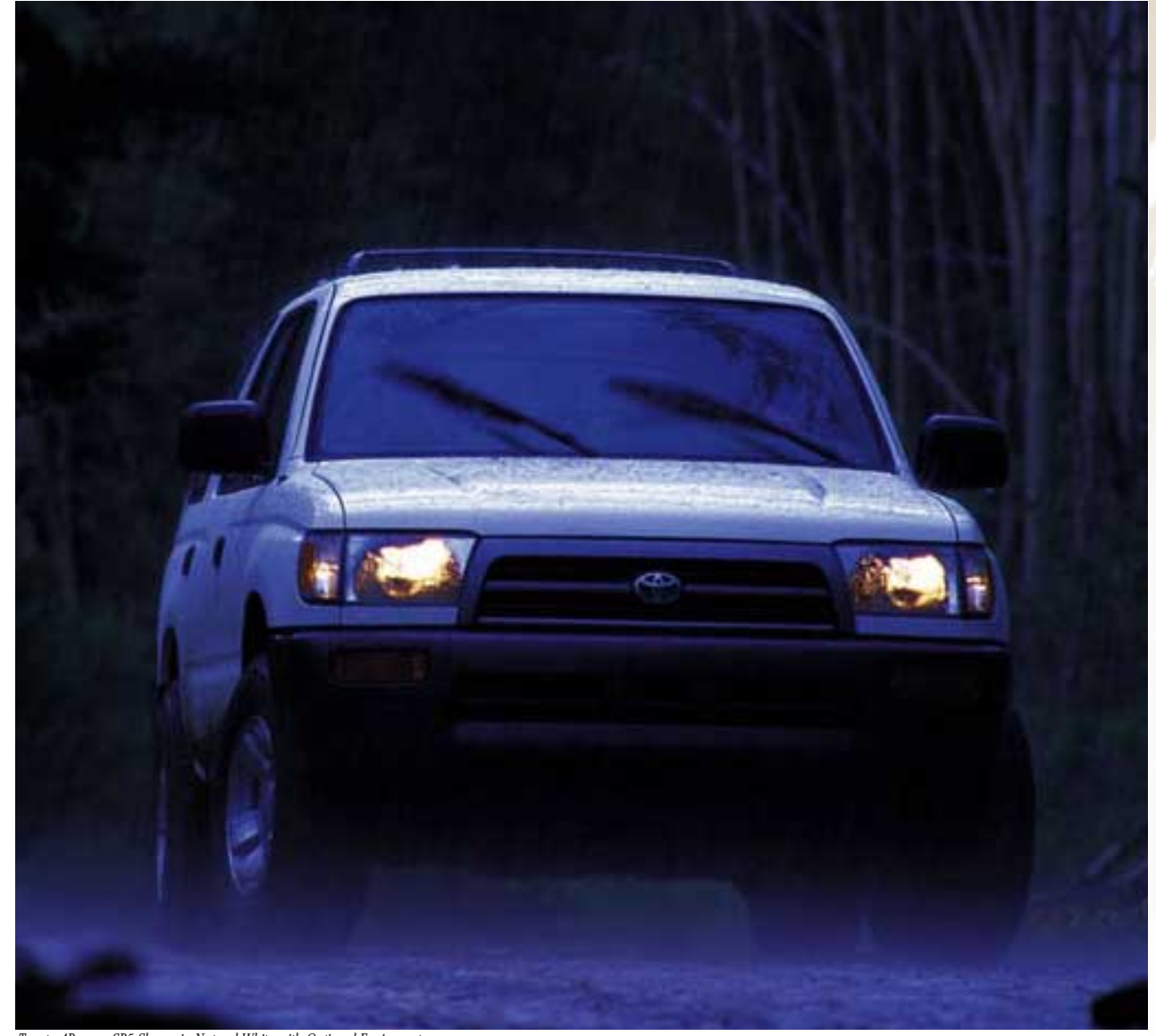
Toyota 4Runner SR5 Shown in Natural White with Optional Equipment