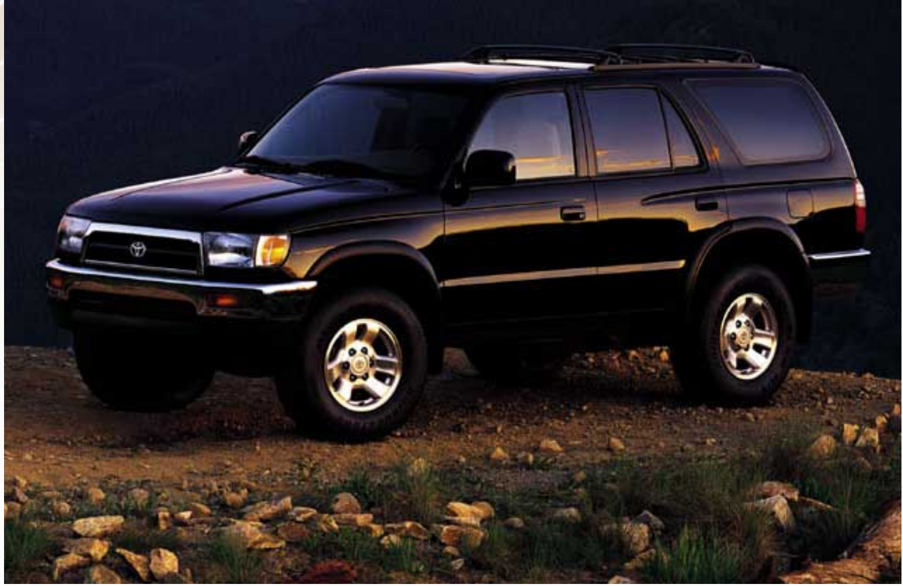
4Runner SR5 V6 Shown in Black with Optional Equipment