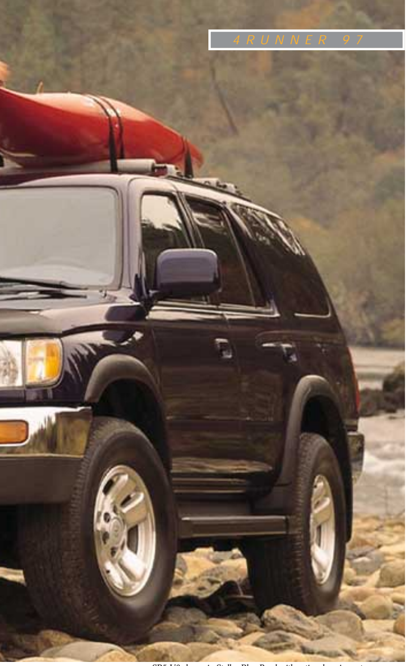
SR5 V6 shown in Stellar Blue Pearl with optional equipment